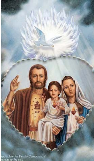
Apocalypse for Family Consecration can not be sold