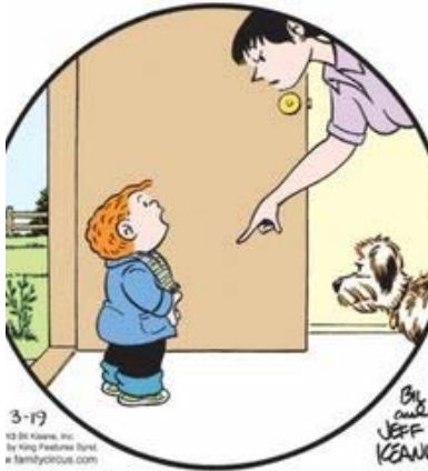
3-17 © 2014 King Features Inc. Distributed by King Features Syndicate www.familycomic.com By Jeff Keane

"Yes, I heard you calling me, but I thought you were kidding."