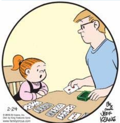
2-24 © 2014 King Features Inc. Distributed by King Features Syndicate www.familycomic.com By Jeff Keane

"Yes, I heard you calling me, but I thought you were kidding."